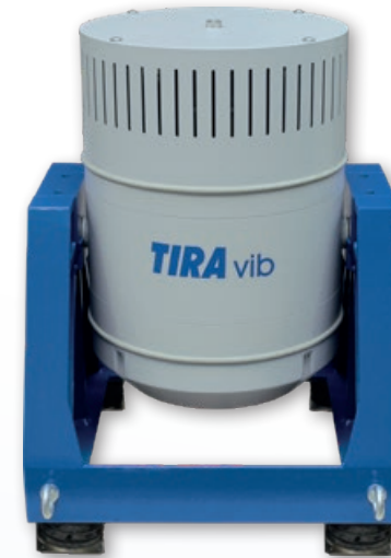
Modal shaker S 55240-M/LSS

A standard feature on all modal shakers is a trunnion mount. This allows a great variety of coupling options.