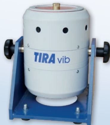
Modal shaker S 51120-M

The Modal systems TV 51120-MNC and TV 51130-MSK are a special development of TIRA to increase the mobility. The 200 N shaker does not require an additional cooling unit and the 350 N shaker has an integrated cooling blower.