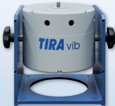
Modal shaker S 51110-MOSP

A standard feature on all modal shakers is a trunnion mount. This allows a great variety of coupling options.