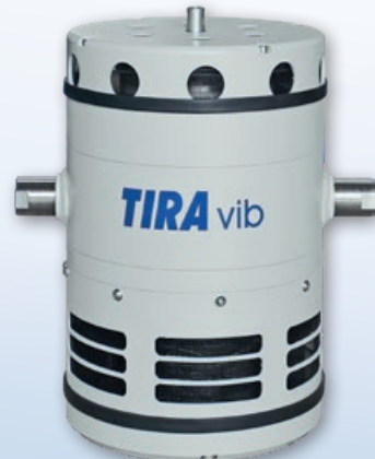
Modal shaker S 51130-MSK